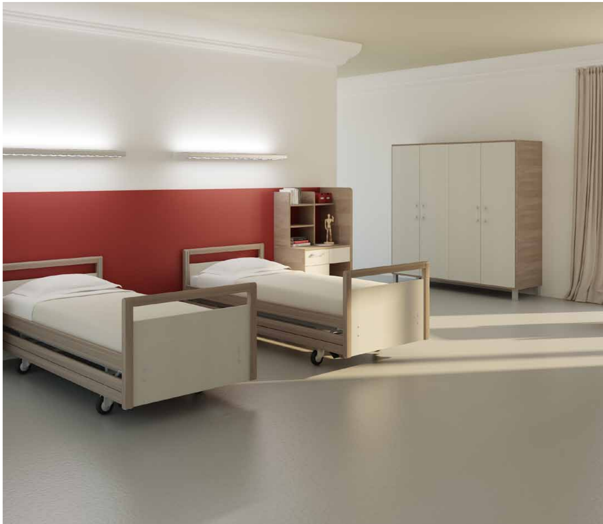
Armadi con piedi in alluminio, masselli in legno di noce e maniglie in gomma morbida antitrauma effetto acidato. Cupboards with aluminium feet, solid walnut and soft shockproof rubber handles with etched effect.