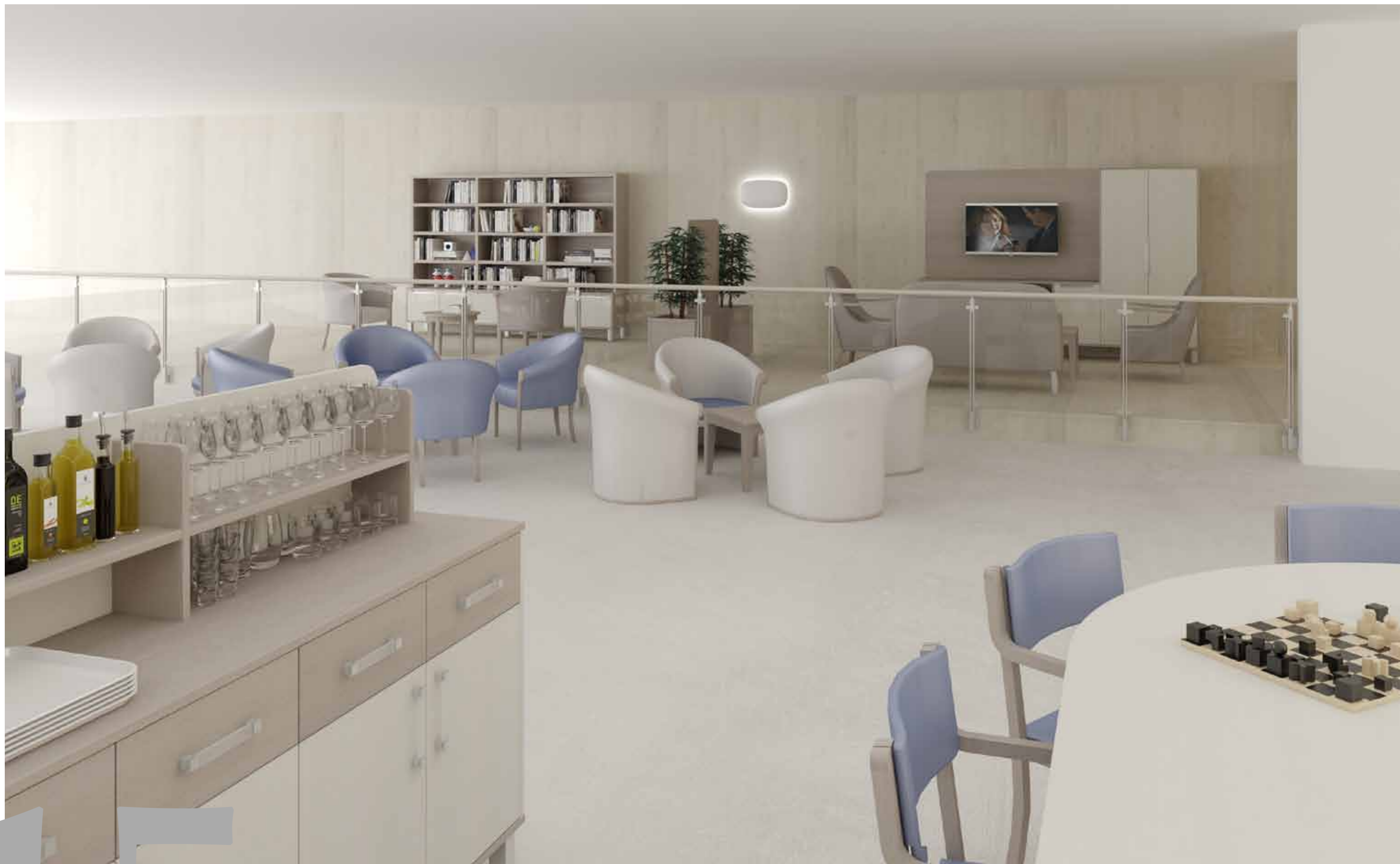
Poltrone e pozzetti con rivestimento coordinato in ecopelle, in gomma morbida antitrauma effetto acidato e colore beige sabbia finitura opaca. Armchairs with matching faux leather finishing, soft shockproof rubber handles with etched effect and sand beige matte colour.